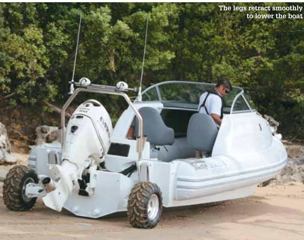
The legs retract smoothly to lower the boat

For more information contact Sealegs, ph 09 414 5542, email info@sealegs.com or visit sealegs.com .