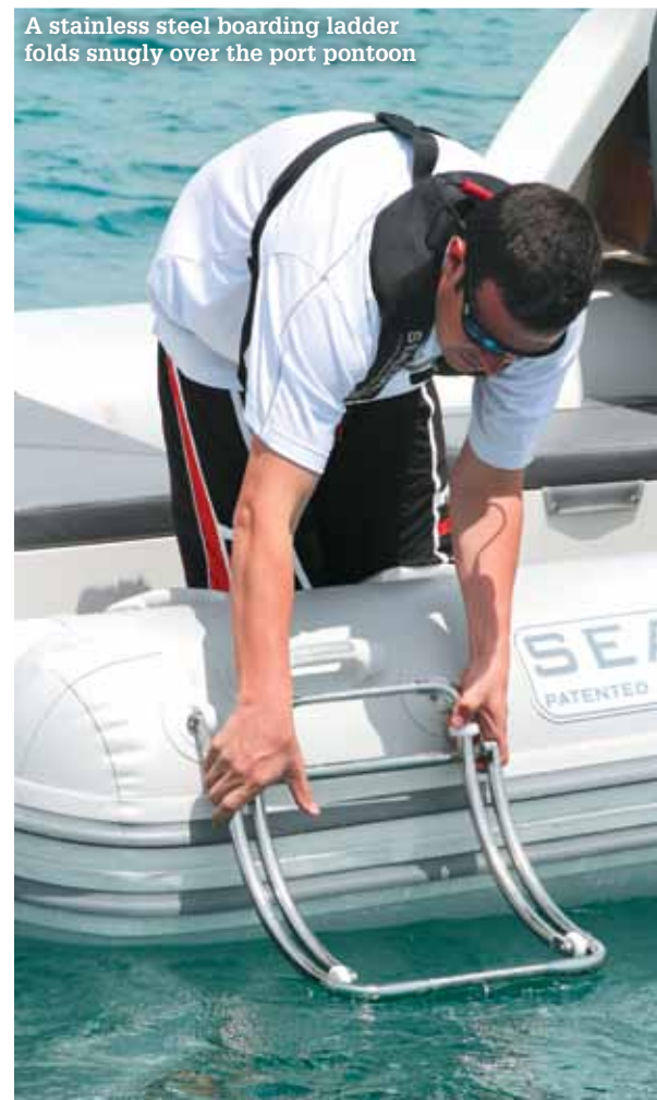
A stainless steel boarding ladder folds snugly over the port pontoon

In earlier models, the motor was located under the skipper's seat, but in this version it has been moved further back to compensate for the weight of the cabin over the bow area and improve deck utilisation. This new position has the extra benefit of making the whole boat quieter while the auxiliary engine is running. One of the problems with hydraulics is the heat generated but the new, extended runtime technology enables this system to now be run for 30 minutes in the hour.