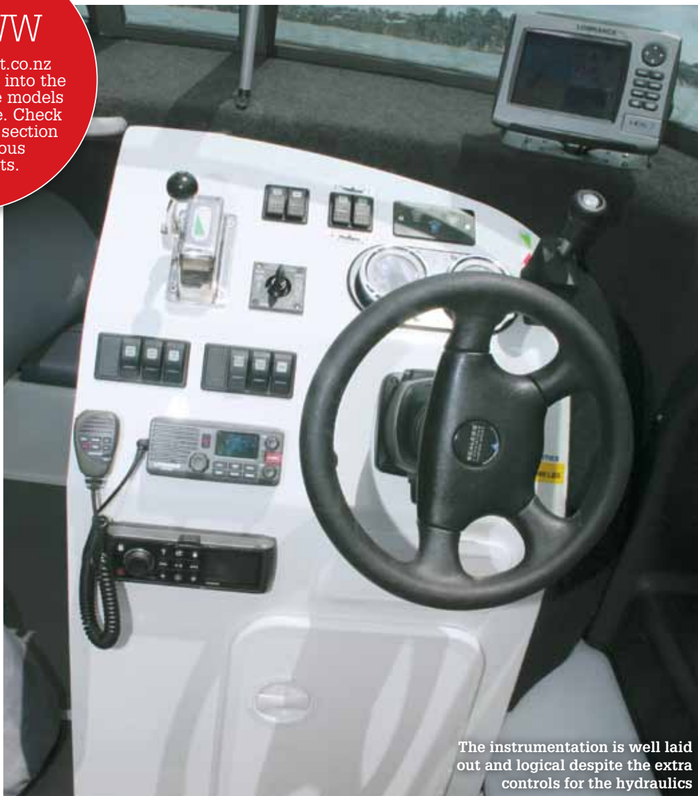
The instrumentation is well laid out and logical despite the extra controls for the hydraulics

Before getting into the water, we had a close look at the new model. Featuring the now standard all-wheel-drive, it is clear that the hydraulics driving the wheels are seriously well-made pieces of engineering. There are