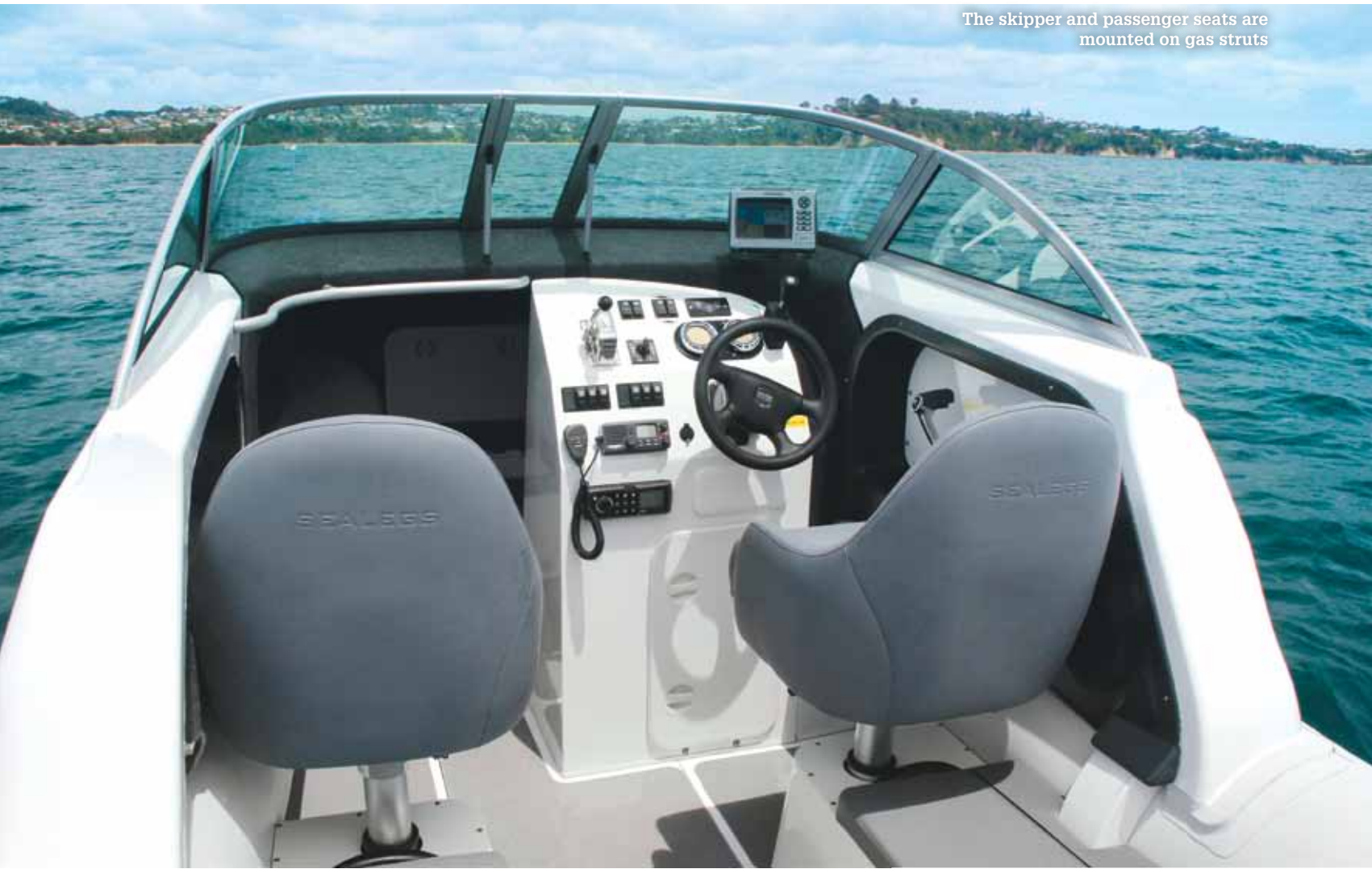
The skipper and passenger seats are mounted on gas struts

comfortable seating while hiding a couple of storage lockers underneath. The inside of the cabin is carpeted, with a large hatch that provides access to the anchor locker and an overhead polycarbonate hatch for light and fresh air when required.