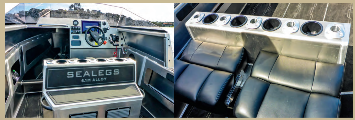
The central engine box doubles as seating with two single forward-facing fold-down bolster seats.